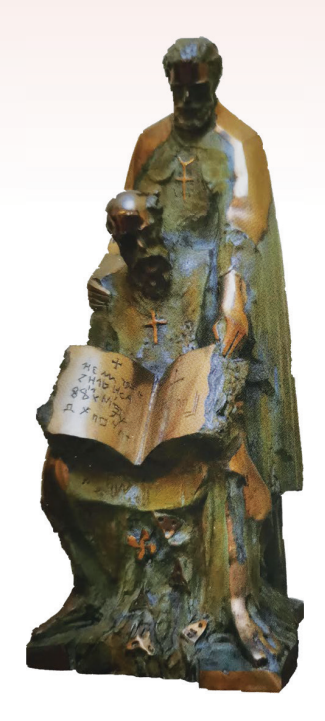
The Holy brothers Cyril and Methodius