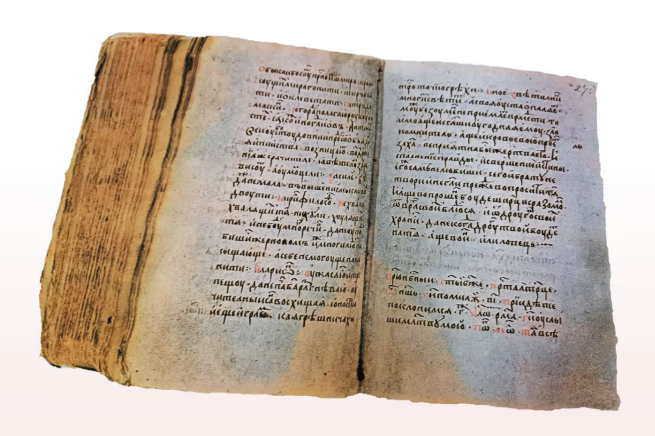
"Wise Thoughts of Konstantin the Philosopher" – an ancient Slavic script